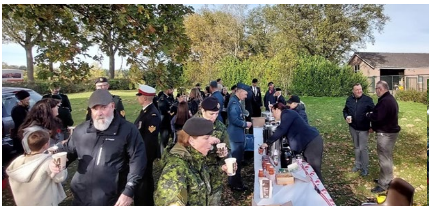
Many wreaths and catching up afterwards with a hot drink.