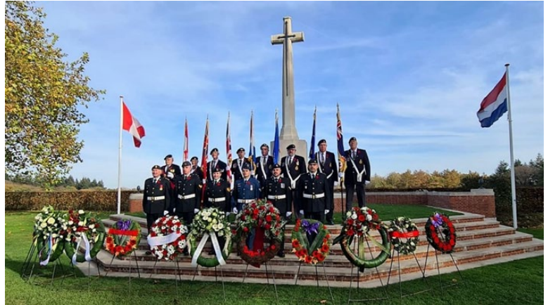
Colour Party together with the Guards of Honour

There were many eager consumers for the hot drinks. That the drinks were served with charm and a smile was an encore.