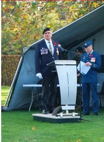
Act of Remembrance by the President of RCL Branch 005.