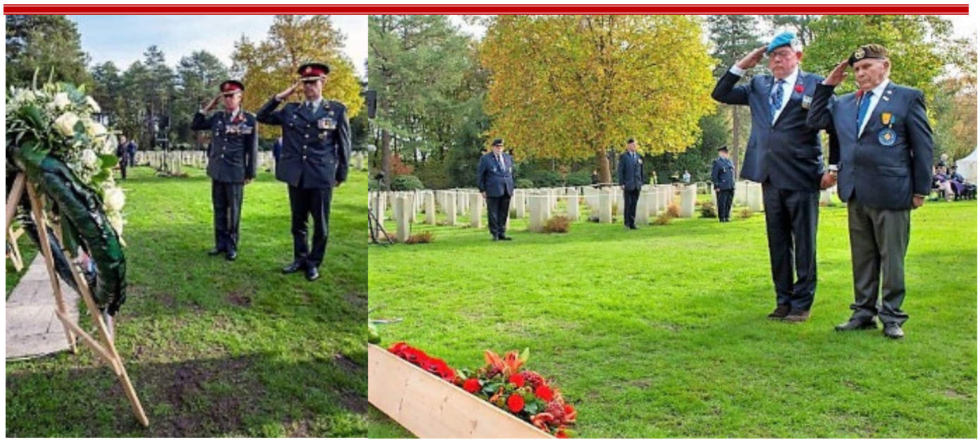
Dutch Forces Veterans 1