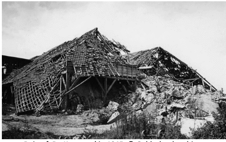
Ruin of ,De Korevaar' in 1945.

Below the text is a 'ROLL OF HONOUR' with the names of 42 fallen. In addition, 111 soldiers had suffered injuries.