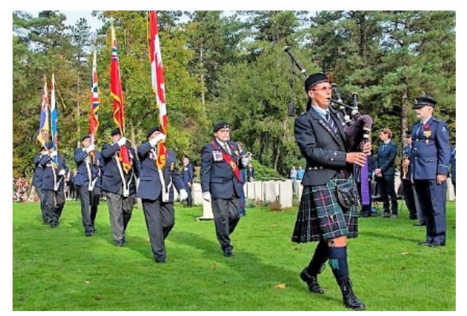
March off the Colours