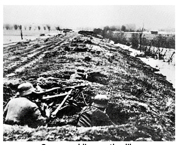
German soldiers on the dike

You activate it by clicking on the photo.