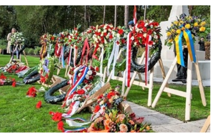
We will remember them