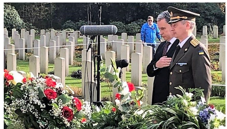
Representatives Ukraine

That was the reason, she said, why colleagues from the Ukrainian embassy were invited and attended for the first time the ceremony.