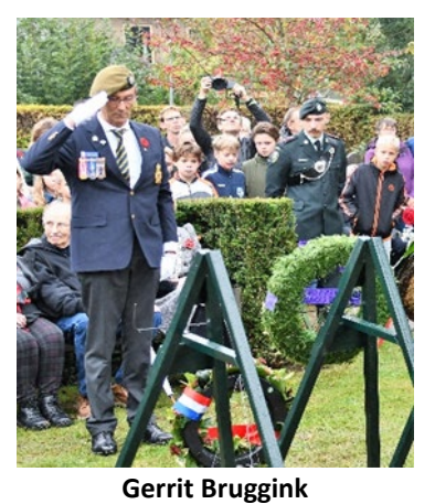
Representative QOR in NL