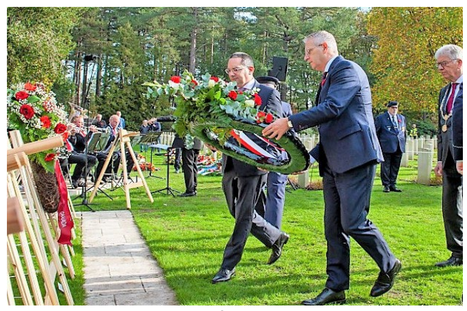
Mayors of Brabant Wal